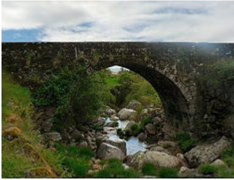
The remaining Roman-era bridge crossing the Ribeira de Loriga

Loriga was founded originally along a column between ravines where today the historic centre exists. The site was ostensibly selected more than 2600 years ago, owing to its defensibility, the abundance of potable water and pasturelands, and lowlands that provided conditions to practice both hunting and gathering/agriculture. [1]