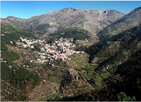
A bridge over a ravine in Loriga, with the pastures of the valley landscape

Known locally as the " Portuguese Switzerland " due to its landscape that includes a principal settlement nestled in the mountains of the Serra da Estrela Natural Park . [2] It is located in the south-central part of the municipality of Seia, along the southeast part of the Serra, between several ravines, but specifically the Ribeira de São Bento and Ribeira de Loriga; [2] it is 20 kilometres from Seia, 80 kilometres from Guarda and 300 kilometres from the national capital (Lisbon). A main village is accessible by the national roadway E.N. 231, that connects directly to the region of the Serra da Estrela by way of E.N.338 (which was completed in 2006), or through the E.N.339, a 9.2 kilometre access that transits some of the main elevations (960 metres near Portela do Arão or Portela de Loriga, and 1650 metres around the Lagoa Comprida).