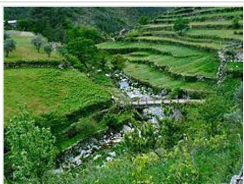
A bridge over a ravine in Loriga, with the pastures of the valley landscape

Known locally as the " Portuguese Switzerland " due to its landscape that includes a principal settlement nestled in the mountains of the Serra da Estrela Natural Park. [2] It is located in the south-central part of the municipality of Seia, along the southeast part of the Serra, between several ravines, but specifically the Ribeira de São Bento and Ribeira da Nave; [2] it is 20 kilometres from Seia, 80 kilometres from Guarda and 300 kilometres from the national capital (Lisbon). A main village is accessible by the national roadway E.N. 231, that connects directly to the region of the Serra da Estrela by way of E.N.338 (which was completed in 2006), or through the E.N.339, a 9.2 kilometre access that transits some of the main elevations (960 metres near Portela do Arão or Portela de Loriga, and