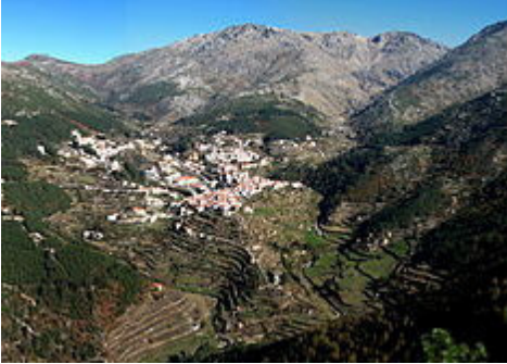
A bridge over a ravine in Loriga, with the pastures of the valley landscape

Known locally as the " Portuguese Switzerland " due to its landscape that includes a principal settlement nestled in the mountains of the Serra da Estrela Natural Park . [2] It is located in the south-central part of the municipality of Seia, along the southeast part of the Serra, between several ravines, but specifically the Ribeira de São Bento and Ribeira de Loriga; [2] it is 20 kilometres from Seia, 80 kilometres from Guarda and 300 kilometres from the national capital (Lisbon). A main village is accessible by the national roadway E.N. 231, that connects directly to the region of the Serra da Estrela by way of E.N.338 (which was completed in 2006), or through the E.N.339, a 9.2 kilometre access that transits some of the main elevations (960 metres near Portela do Arão or Portela de Loriga, and 1650 metres around the Lagoa Comprida).