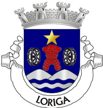
Coat of arms

Statistics from INE (2001); geographic detail from Instituto Geográfico Português (2010)