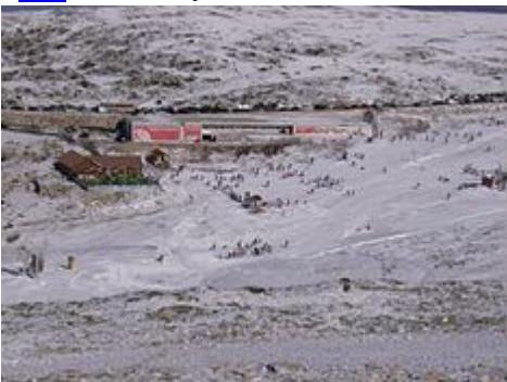
Vodafone Ski Resort , Serra da Estrela , in Loriga.

Textiles are the principal local export; Loriga was a hub the textile and wool industries during the