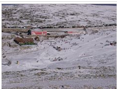
Vodafone Ski Resort, Serra da Estrela, in Loriga.

Textiles are the principal local export; Loriga was a hub the textile and wool industries during the mid-19th century, in addition to being subsistence agriculture responsible for the cultivation of corn. The Loriguense economy is based on metallurgical industries, bread-making, commercial shops, restaurants and agricultural support services.