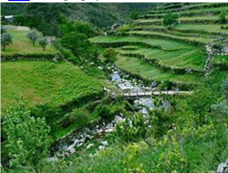
A bridge over a ravine in Loriga, with the pastures of the valley landscape

Known locally as the " Portuguese Switzerland " due to its landscape that includes a principal settlement nestled in the mountains of the Serra da Estrela Natural Park . [2] It is located in the south-central part of the municipality of Seia, along the southeast part of the Serra, between several ravines, but specifically the Ribeira de São Bento and Ribeira de Loriga; [2] it is 20 kilometres from Seia, 80 kilometres from Guarda and 300 kilometres from the national capital (Lisbon). A main city is accessible by the national roadway E.N. 231, that connects directly to the region of the Serra da Estrela by way of E.N.338 (which was completed in 2006), or through the E.N.339, a 9.2 kilometre access that transits some of the main elevations (960 metres near Portela do Arão or Portela de Loriga, and 1650 metres around the Lagoa Comprida).