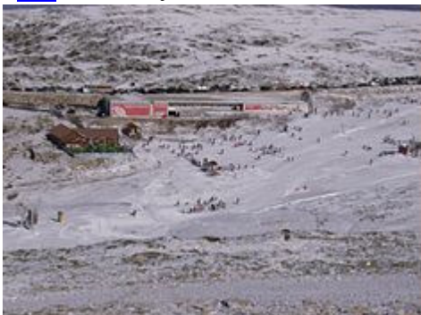
Vodafone Ski Resort , Serra da Estrela , in Loriga.

Textiles are the principal local export; Loriga was a hub the textile and wool industries during the