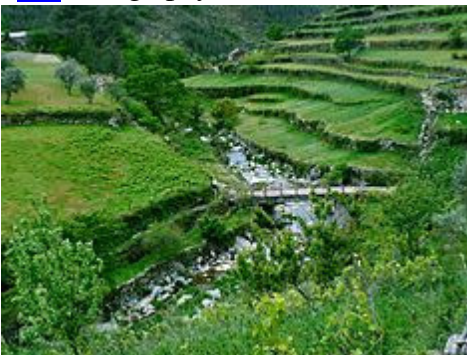
A bridge over a ravine in Loriga, with the pastures of the valley landscape

Known locally as the " Portuguese Switzerland " due to its landscape that includes a principal settlement nestled in the mountains of the Serra da Estrela Natural Park . [2] It is located in the south-central part of the municipality of Seia, along the southeast part of the Serra, between several ravines, but specifically the Ribeira de São Bento and Ribeira de Loriga; [2] it is 20 kilometres from Seia, 80 kilometres from Guarda and 300 kilometres from the national capital (Lisbon). A main city is accessible by the national roadway E.N. 231, that connects directly to the region of the Serra da Estrela by way of E.N.338 (which was completed in 2006), or through the E.N.339, a 9.2 kilometre access that transits some of the main elevations (960 metres near Portela do Arão or Portela de Loriga, and 1650 metres around the Lagoa Comprida).