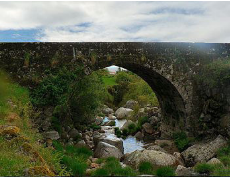
The remaining Roman-era bridge crossing the Ribeira de Loriga

Loriga was founded along a column between ravines where today the historic centre exists. The site was ostensibly selected more than 2600 years ago, owing to its defensibility, the abundance of potable water and pasturelands, and lowlands that provided conditions to practice both hunting and gathering/agriculture. [3]