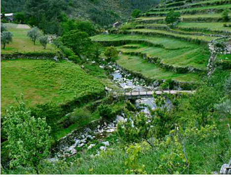
A bridge over a ravine in Loriga, with the pastures of the valley landscape

The region is carved by U-shaped glacial valleys, modelled by the movement of ancient glaciers. The main valley, Vale de Loriga was carved by longitudinal abrasion that also created rounded pockets, where the glacial resistance was minor. Starting at an altitude of 1991 metres along the Serra da Estrela the valley descends abruptly until 290 metres above sea level (around Vide), passing villages such as Cabeça, Casal do Rei and Muro. The central village, Loriga, is seven kilometres from Torre (the highest point), but the parish is sculpted by cliffs, alluvial plains and glacial lakes deposited during millennia of glacial erosion, and surrounded by rare ancient forest that surrounded the lateral flanks of these glaciers.