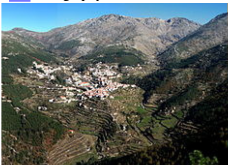
A bridge over a ravine in Loriga, with the pastures of the valley landscape

Known locally as the " Portuguese Switzerland " due to its landscape that includes a principal settlement nestled in the mountains of the Serra da Estrela Natural Park . [2] It is located in the south-central part of the municipality of Seia, along the southeast part of the Serra, between several ravines, but specifically the Ribeira de São Bento and Ribeira de Loriga; [2] it is 20 kilometres from Seia, 80 kilometres from Guarda and 300 kilometres from the national capital (Lisbon). A main village is accessible by the national roadway E.N. 231, that connects directly to the region of the Serra da Estrela by way of E.N.338 (which was completed in 2006), or through the E.N.339, a 9.2 kilometre access that transits some of the main elevations (960 metres near Portela do Arão or Portela de Loriga, and 1650 metres around the Lagoa Comprida).