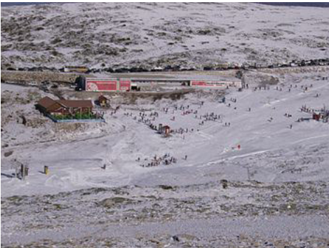
Vodafone Ski Resort, Serra da Estrela, in the town of Loriga.

Textiles are the principal local export; Loriga was a hub the textile and wool industries during the mid-19th century, in addition to being subsistence agriculture responsible for the cultivation of corn. The Loriguense economy is based on metallurgical industries, bread-making, commercial shops, restaurants and agricultural support services. While that textile industry has since dissipated, the town began to attract a tourist trade due to its proximity to the Serra da Estrela and Vodafone Ski Resort (the only ski center in Portugal), which was constructed within the parish limits.