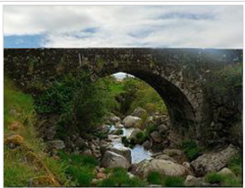
The remaining Roman-era bridge crossing the Ribeira de Loriga

Loriga was founded originally along a column between ravines where today the historic centre exists. The site was ostensibly selected more than 2600 years ago, owing to its