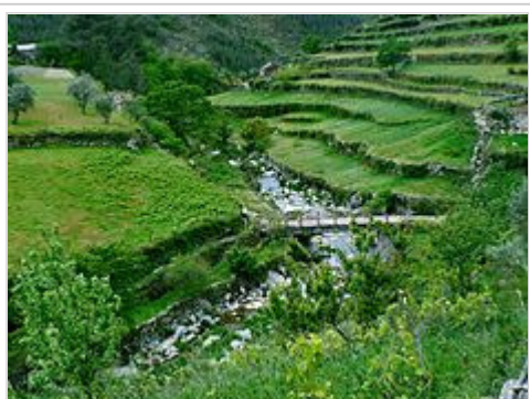
A bridge over a ravine in Loriga, with the pastures of the valley landscape

Known locally as the " Portuguese Switzerland " due to its landscape that includes a principal settlement nestled in the mountains of the Serra da Estrela Natural Park. [2] It is located in the south-central part of the municipality of Seia, along the southeast part of the Serra, between several ravines, but specifically the Ribeira de São Bento and Ribeira de Loriga; [2] it is 20 kilometres from Seia, 80 kilometres from Guarda and 300 kilometres from the national capital (Lisbon). A main village is accessible by the national roadway E.N. 231, that connects directly to the region of the Serra da Estrela by way of E.N.338 (which was completed in 2006), or through the E.N.339, a 9.2 kilometre access that transits some of the main elevations (960 metres near Portela do Arão or Portela de Loriga, and