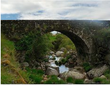
The remaining Roman-era bridge crossing the Ribeira de Loriga

Loriga was founded originally along a column between ravines where today the historic centre exists. The site was ostensibly selected more than 2600 years ago, owing to its defensibility, the abundance of potable water and pasturelands, and lowlands that provided conditions to practice both hunting and gathering/agriculture. [1]