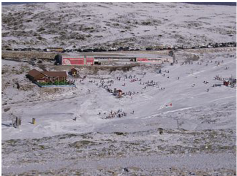
Vodafone Ski Resort, Serra da Estrela, in the town of Loriga.

Known locally as the "Portuguese Switzerland" due to its landscape that includes a principal settlement nestled in the mountains of the Serra da Estrela Natural Park. [4] It is located in the south-central part of the municipality of Seia, along the southeast part of the Serra, between several ravines, but specifically the Ribeira de São Bento and Ribeira da Nave; [4] it is 20 kilometres from Seia, 80 kilometres from Guarda and 300 kilometres from the national capital (Lisbon). A main town is accessible by the national roadway E.N. 231, that connects directly to the region of the Serra da Estrela by way of E.N.338 (which was completed in 2006), or through the E.N.339, a 9.2 kilometre access that transits some of the main elevations (960 metres near Portela do Arão or Portela de Loriga, and 1650 metres around the Lagoa Comprida).