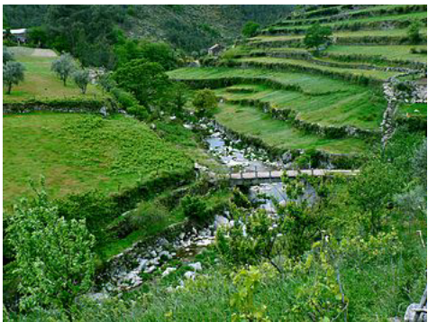
A bridge over a ravine in Loriga, with the pastures of the valley landscape

seven kilometres from Torre (the highest point), but the parish is sculpted by cliffs, alluvial plains and glacial lakes deposited during millennia of glacial erosion, and surrounded by rare ancient forest that surrounded the lateral flanks of these glaciers.