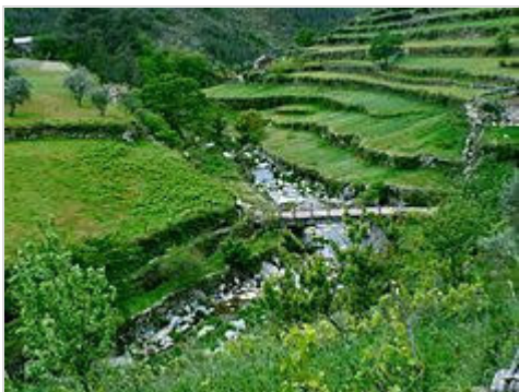
A bridge over a ravine in Loriga, with the pastures of the valley landscape

Known locally as the " Portuguese Switzerland " due to its landscape that includes a principal settlement nestled in the mountains of the Serra da Estrela Natural Park. [2] It is located in the south-central part of the municipality of Seia, along the southeast part of the Serra, between several ravines, but specifically the Ribeira de São Bento and Ribeira de Loriga; [2] it is 20 kilometres from Seia, 80 kilometres from Guarda and 300 kilometres from the national capital (Lisbon). A main village is accessible by the national roadway E.N. 231, that connects directly to the region of the Serra da Estrela by way of E.N.338 (which was completed in 2006), or through the E.N.339, a 9.2 kilometre access that transits some of the main elevations (960 metres near Portela do Arão or Portela de Loriga, and